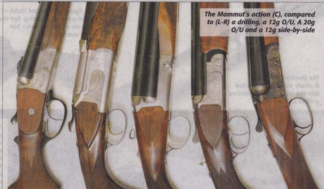
The Mammut's action (C), compared to (L-R) a drilling, a 12g O/U, A 20g O/U and a 12g side-by-side

was more noticeable than I anticipated from a gun whose weight of 3.44kg is well above the norm for a 20g. It was quite flat-shooting too, with patterns from all 3 barrels well centred on the bead.