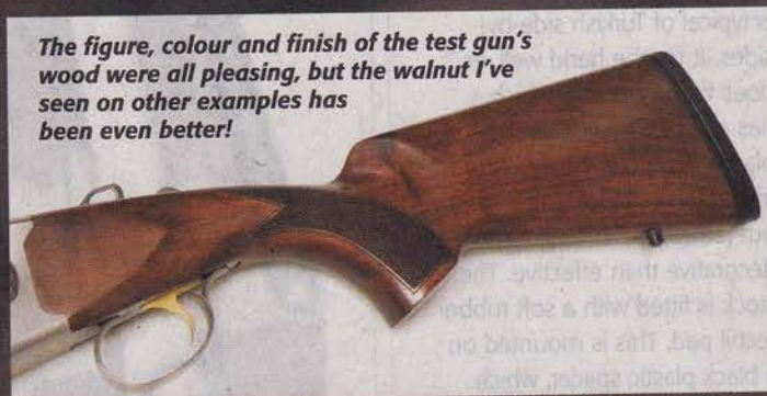
The figure, colour and finish of the test gun's wood were all pleasing, but the walnut I've seen on other examples has been even better!