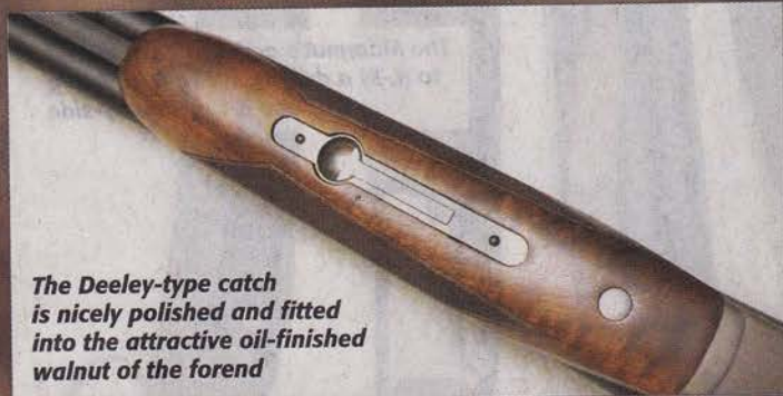
The Deeley-type catch is nicely polished and fitted into the attractive oil-finished walnut of the forend