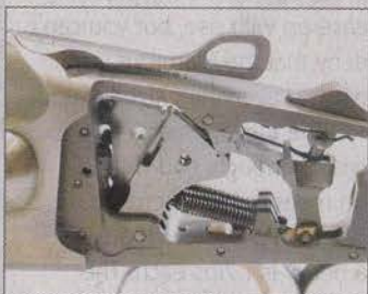
Here, the right barrel has been fired, so the far tumbler is forward, the far spring relaxed and the far sear dropped. Note the large contact areas on the top lever and safety button

The Mammut was agreeable to shoot, though – perhaps due to the shortish stock – recoil