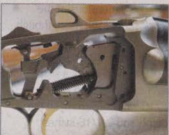
Here, both the right and left barrels have been fired, so only the central components of the lock remain cocked